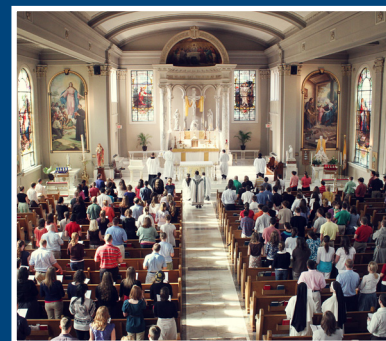
Catholic: the circle is a symbol of universality and of the world; it is never-ending, much like wedding ring symbolism