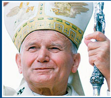
Crucifix: this image is of the crucifix of Bl. John Paul II who blessed the mission of FOCUS, which was an answer to his call for the New Evangelization